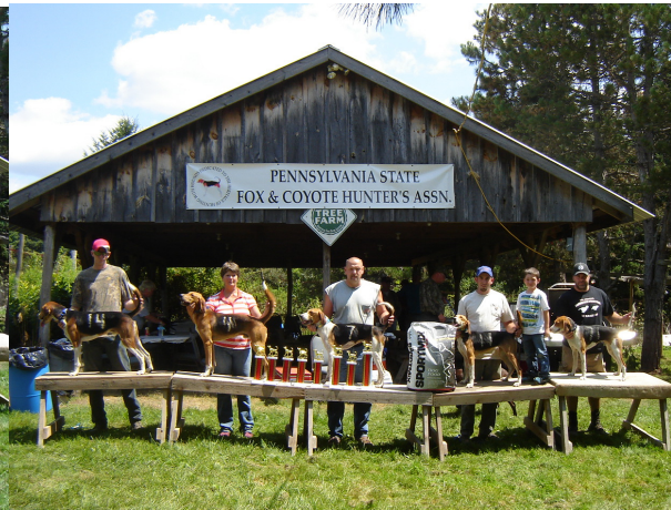
August 9 th Speed & Drive – see article below for details