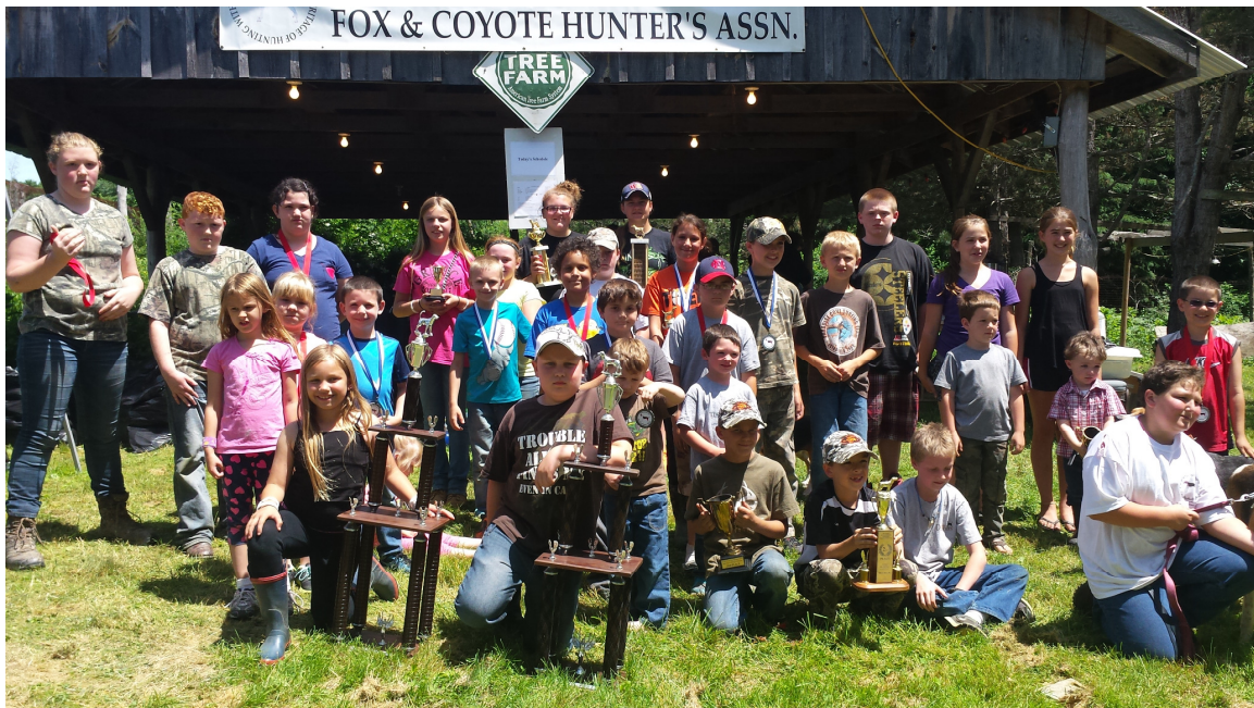
Kid's Take Home the Hardware on Family Day